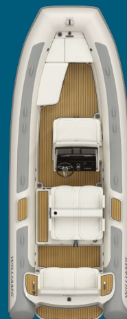
— 625 — 11 PERSONS SOLAS AVAILABLE