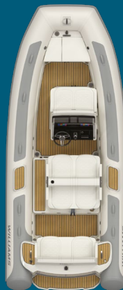
— 565 — 9 PERSONS SOLAS AVAILABLE