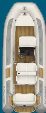
— 505 — 8 + 1 PERSONS SOLAS AVAILABLE