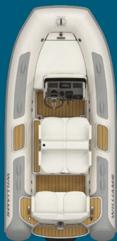
— 415 — 6 PERSONS