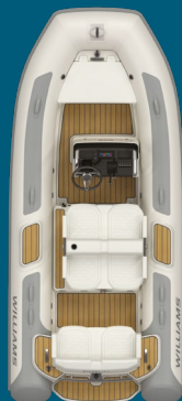
— 445 — 7+1 PERSONS