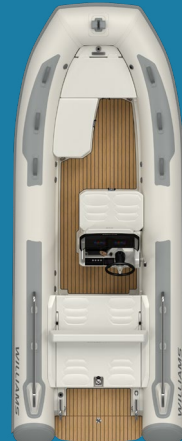
— 520 — 7 PERSONS