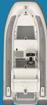
— 435 — 7 PERSONS