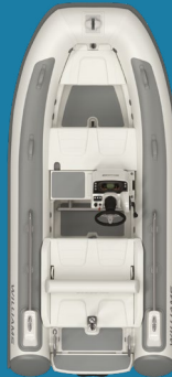
— 395 — 6 + 1 PERSONS