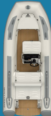
— 460 — 6 PERSONS