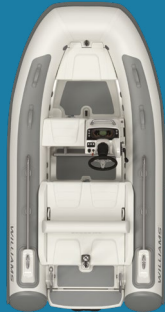
— 345 — 5 PERSONS