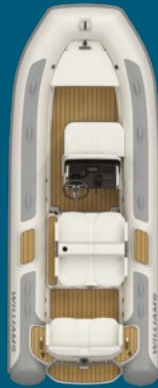
505 8 + 1 PERSONS SOLAS AVAILABLE