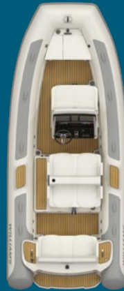
565 9 PERSONS SOLAS AVAILABLE