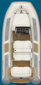
415 6 PERSONS