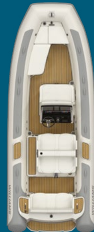
625 11 PERSONS SOLAS AVAILABLE