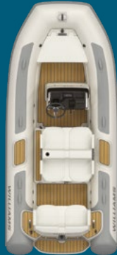
445 7+1 PERSONS